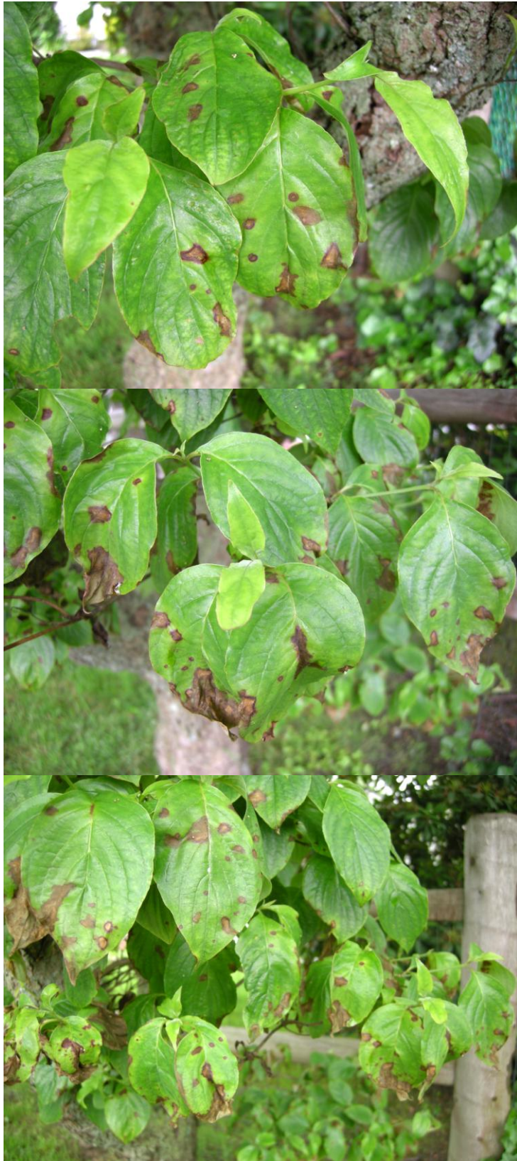
Fig. 2. Leaf spot and leaf blotch symptoms caused by dogwood anthracnose. Note the tan spots with purple rims in the top photograph. Larger tan blotches are more conspicuous in the middle and bottom photos.

Combating the fungus disease with pruning and fungicide applications will be helpful only if trees are also given the very best of care. Dogwoods must be protected from drought with mulching and supplemental watering during summer and fall dry spells. A mulched area around the base of the tree will reduce the likelihood of lawnmower wounds on the trunk, which predispose the tree to attack by borers (insects that bore in the trunk causing damage to the interior wood).