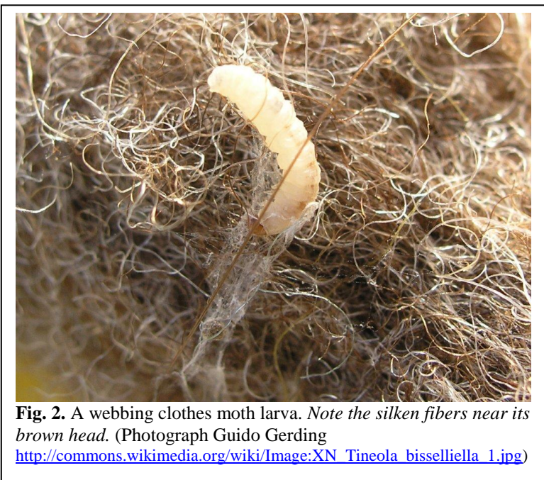
Fig. 2. A webbing clothes moth larva. Note the silken fibers near its brown head.

c) When making purchases, look for woolens and wool synthetic blends that have been treated by the manufacturer with a moth resistant compound.