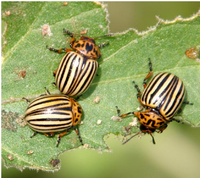
Fig. 1. Colorado potato beetle adults.