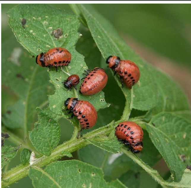
Fig. 2. Colorado potato beetle larvae (Rowena Hopkins, Moncton Naturalists' Club)

Description: The Colorado potato beetle was first described in 1824 from the upper Missouri River Valley, where it fed on a weed called buffalo bur or sand bur. When early settlers first began to plant potatoes, the beetles discovered a new food plant.