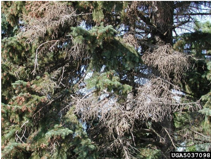
Figure 1 – Branch and twig dieback on Picea pungens due to infection from Cytospora spp.