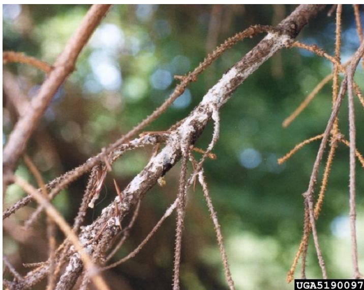
Fig. 2 – Symptoms of Cytospora canker on spruce. Note the build up of white resin on the bark.

Introduction: Many frequently encountered twig and branch killing disease of ornamental, forest, and fruit trees are caused by fungi of the genera Cytospora and Leucocytospora . Many species of these fungi cause cankers on scaffold branches or young tree trunks in addition to twig dieback. The appearance, spread, and control of these twig diebacks and cankers are similar.