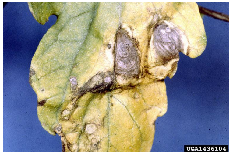
Figure 1. Typical leaf symptom of early blight. (Note the concentric ring pattern or "target-board" symptom, which is a distinct symptom of early blight) (Clemson University, USDA Cooperative Extension Slide Series)

SEPTORIA LEAF SPOT: The causal agent for the leaf spot is Septoria lycopersici . Septoria leaf spot is a fungus disease of tomato foliage and is of no importance as a fruit rot. The disease is