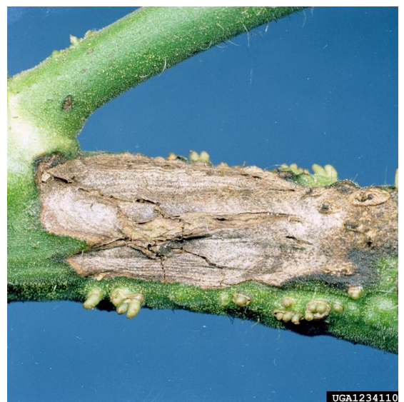
Figure 2. Stem girdling (canker) due to early blight infection (Note the concentric ring pattern)