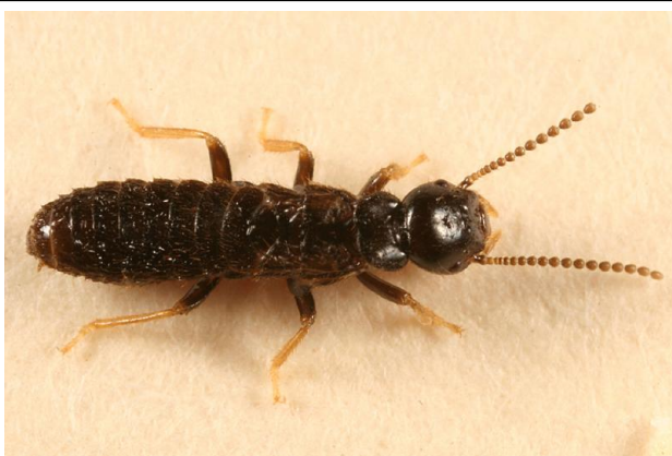
Fig. 3. A primary reproductive subterranean termite after the wings have broken off. Note the straight antennae and "broad waist".