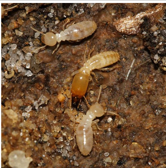
Fig. 1 Subterranean termite workers (top and bottom) and a soldier (middle). Note the large yellowish head on the soldier in comparison to the much smaller and lighter color head on the workers.

Termites feed upon wood, including structural wood especially that which is in contact with soil. In addition they can also feed on old roots, stumps of trees, fallen tree limbs and branches on the ground, and similar materials. Termites have also been known to attack swimming pool liners and PVC pipes. They are beneficial when they aid in reduction of wood and similar cellulose products into compounds that can be used again by other living organisms. Occasionally termites attack living plants, including the roots of shrubs and trees. In buildings, in addition to structural wood, termites feed on cellulose materials such as wood fixtures, paper, books, cotton, and related products.