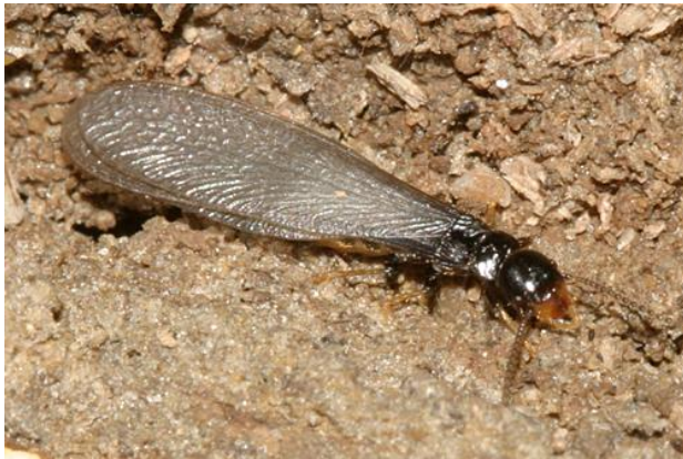
Fig. 2. A primary reproductive subterranean termite. Note the translucent wings that extend well beyond the end of its body.

to those of termites which are straight. Furthermore, the four wings of termites are of equal length and nearly twice as long as the termite body, while ant wings are approximately equal to the length of the ant, and the fore and hind wings are of unequal length.