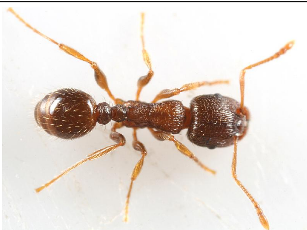
Fig. 4. A pavement ant. Note the elbowed antennae and the "pinched waist".

Wood attacked by termites has runways or passages that are coated with an earth-like material glued to the wood by the termites ( Fig. 5. ). Where the wood has been infested for some time, it may be largely hollowed out with passages. Upon breaking open such wood with a screwdriver or similar tool, many of the hidden worker termites spill out. Another sign of termites in the house is the presence of termite mud tubes ( Fig. 6. ). The tubes are earth-colored because they are composed of soil, mostly sand particles. These shelter tubes are made by termites primarily as a protected runway from the earth to the wood they feed on. These tubes also may serve as swarming exits for the winged termites. Look for these tubes on the basement foundation walls, on wooden posts, studs, mudsills, door and window trim. Wood embedded in earth or in concrete cellar floors (if it contacts soil, if the concrete is cracked, etc.) is especially susceptible to termites.