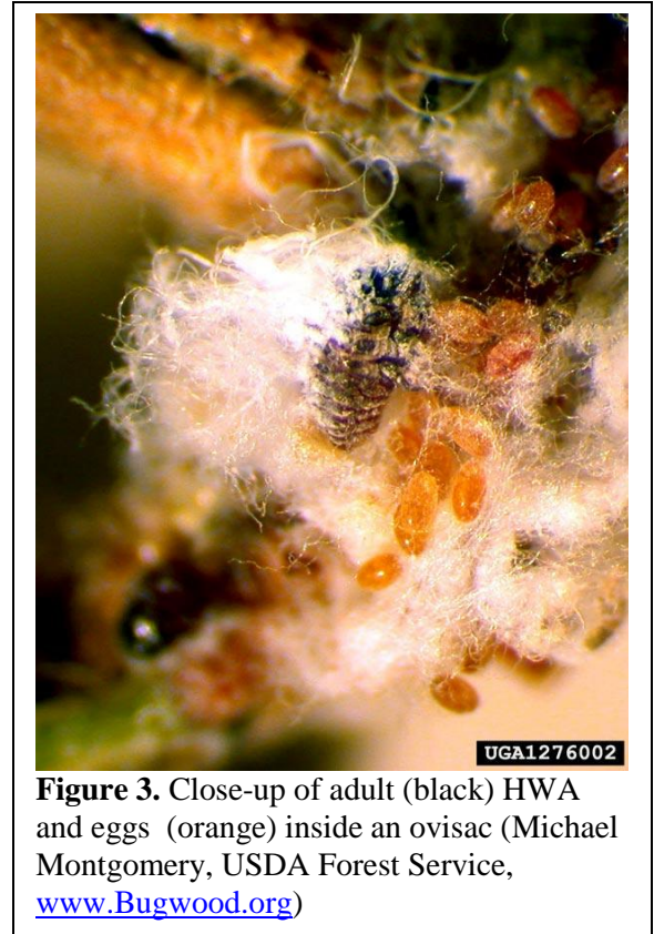
Figure 3. Close-up of adult (black) HWA and eggs (orange) inside an ovisac

Insecticide treatments suggested to homeowners: At the dormant stage (late April to early May), apply horticultural oil. In late June or late September and the following year in early June, treat with insecticidal soap. Thorough coverage with oil or soap is necessary.