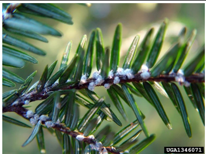
Figure 2. Close-up of white ovisacs.

After feeding for this short period of time they will enter the summer aestivation period where they remain until October. In October these nymphs resume development and