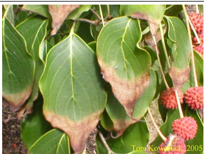
Fig. 2. Leaf scorch on Kousa dogwood in September. (Thomas Kowalsick, Senior Horticulture Consultant, Cornell Cooperative Extension – Suffolk County)