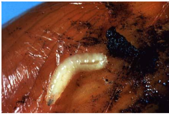
Fig. 3 - The onion maggot. (Pests of the Northeastern United States, Cornell University)

In addition, feeding and burrowing by the maggot may introduce and spread fungal and bacterial pathogens. Such infested and rotting onions present a potential for reducing the quality of adjacent onions that are in storage.