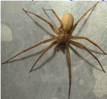
A brown recluse spider. Note the characteristic "violin-shaped" dark marking on the cephalothorax, which helps distinguish this spider from other types.