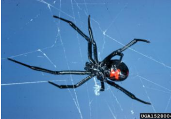
Black Widow Spider