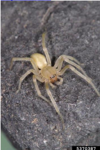
Yellow sac spider (Joseph Berger, www.Bugwood.org )

self-defense. The venom is highly toxic. The bite causes extreme pain, which usually extends to the abdominal muscles. The danger exists because the black widow seeks out dark places in which to construct a retreat, often living in close proximity to people. Female black widow spiders are about a half inch long, with 1 1/2 inch leg spread; males are half that size. For additional information see