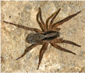
Wolf Spider