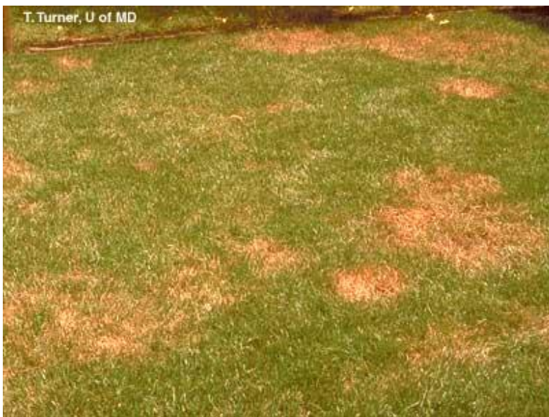
Figure 2. A lawn exhibiting symptoms of summer patch infection. (Note that these symptoms can resemble those associated with other common turfgrass problems.)

Introduction: Kentucky bluegrass ( Poa pratensis ), annual bluegrass ( Poa annua ), and fescues ( Festuca sp.) can be affected during the summer by an interaction of environmental factors and a root and/or crown rot caused by the fungus Magnaporthe poae . This disease is known as Summer Patch. Bentgrasses ( Agrostis sp.) may also become infected but show few symptoms and may continue to perform where other grasses decline.