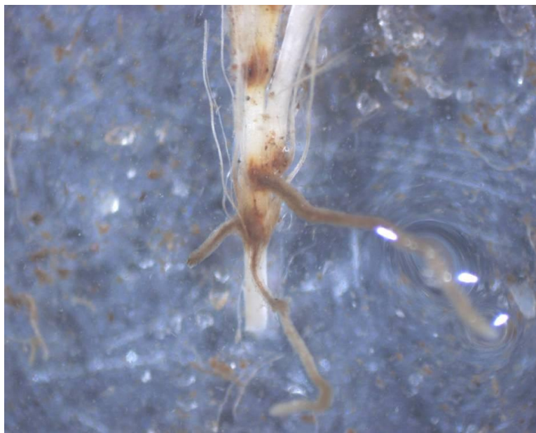
Figure 3. Crown and root rotting symptoms on creeping bentgrass. (J. P. Kerns, Plant Pathology, North Carolina State University)

become evident. As Necrotic Ring Spot may exhibit similar symptoms, microscopic examination is often necessary to determine the cause of the problem. The roots, crowns and stolons of infected plants may appear to be dark brown ( Fig. 3 ) as the dark mycelium of the fungus ( Fig. 4 ) invades the tissue. As the disease progresses, the cortex may begin to rot and plants may die.