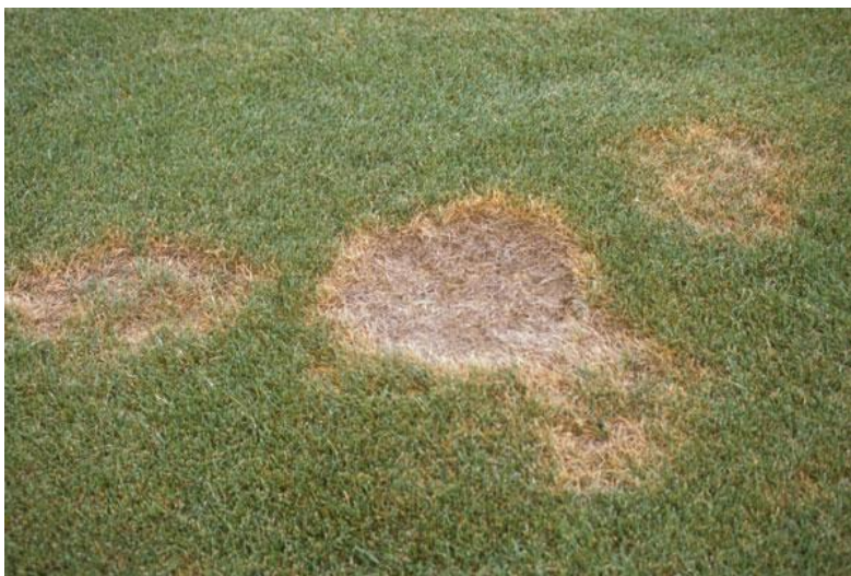
Figure 1. Typical “patch” symptom of summer patch disease.