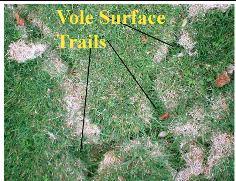
Fig. 2. A series of surface trails in a home lawn. Photograph was taken in the early spring.

Description of Damage: Meadow voles may cause extensive damage to orchards, ornamentals, and tree plantings by girdling seedlings and mature trees. Girdling usually occurs in fall and winter and may not be discovered until the snow melts in the spring. Voles may eat garden crops such as potatoes and sugar beets as well as ornamental herbaceous plants. Pine voles may cause widespread below-ground damage to root systems that may go undetected until the plant is excavated and replaced. Voles may also damage plantings when they build extensive runway and tunnel systems, uprooting the plants or allowing air to get in around the roots. Lawns and golf courses may be damaged aesthetically when depressions form in the ground surrounding well-established runways and burrows.