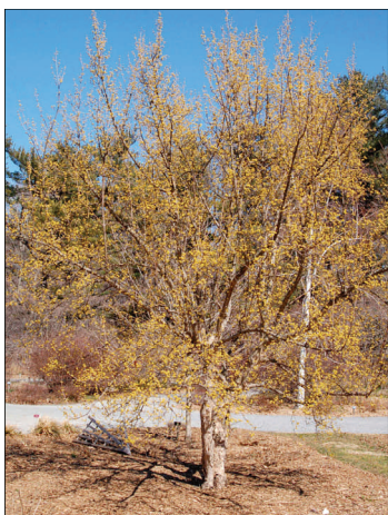
Cornus mas 'Golden Glory' - Corneliancherry Dogwood Early-flowering small tree - Gold Medal Winner 2011

Looking for an attractive tree to add beauty to your landscape? Try one of these award-winning flowering trees! With eye-catching blossoms, these flowering trees grow admirably on Long Island and are not susceptible to pests. These trees are small in stature and make a perfect addition to your property. Plant a Gold Medal flowering tree today!