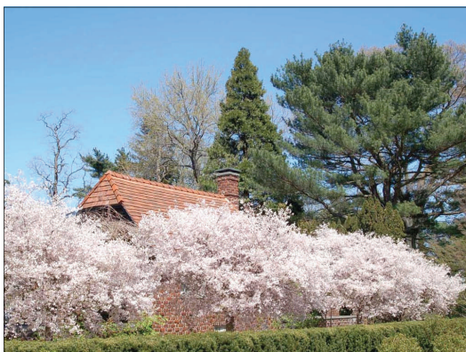
Prunus 'Hally Jolivette' - Hally Jolivette Cherry Beautiful flowering cherry - Gold Medal Winner 2005

Hally Jolivette Cherry is a beautiful, small, flowering cherry tree. This cherry grows fast and flowers profusely even when young. The pink buds of the semi-double flowers start to open in late April through early May. Flowers are light pink or white with a deep red or purple center, and appear before the leaves, providing continually opening blossoms over a 10-20 day period. Hally Jolivette Cherry is densely branched, yet finely textured. It may also be grown as a multi-stemmed shrub, although this form is rarely available. It is very cold-hardy and stress-tolerant for a cherry. Hardy in zones 5-8.